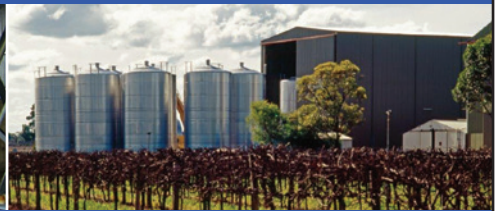
JMA FACTORY, BERRI