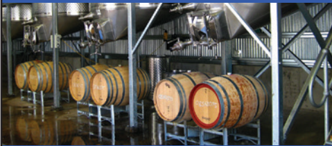
5 TONNE OPEN TOP FERMENTERS