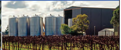
JMA FACTORY, BERRI