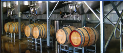
5 TONNE OPEN TOP FERMENTERS