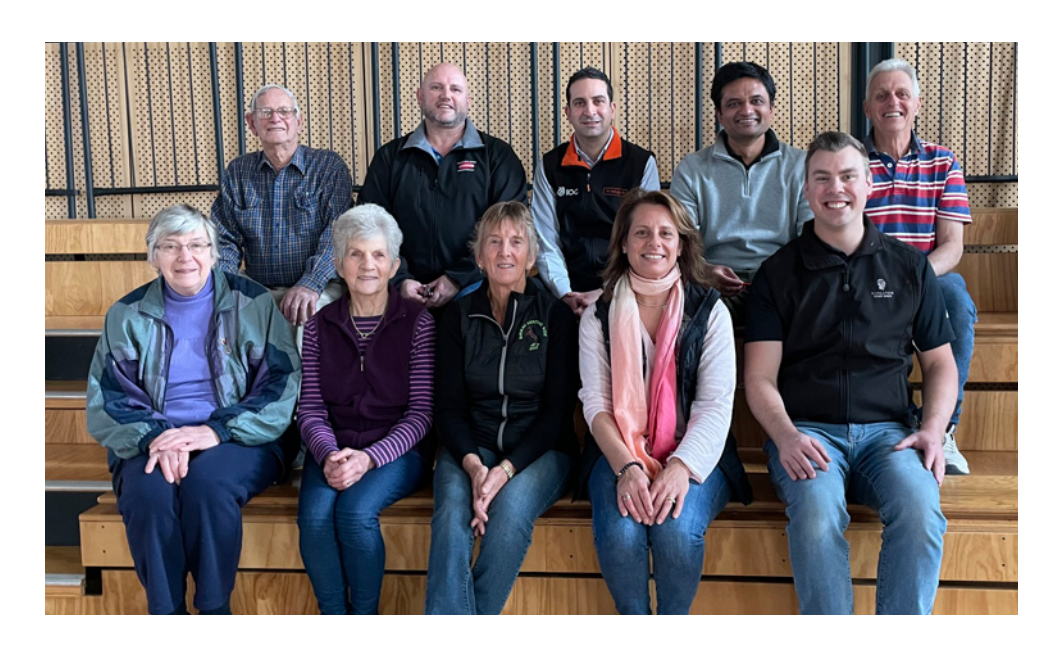
Thank you to all our Stewards and Volunteers